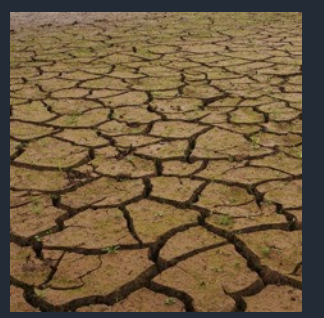
5. Reduction of Food and Water Supply

Poor water and food quality impacts health, leading to diseases like Ebola, cholera (contamination), various infections (listeria, salmonella), bacterial water-borne diseases, and algaeinduced illnesses.<sup>(12)</sup>