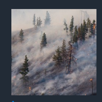
7. Air Pollution