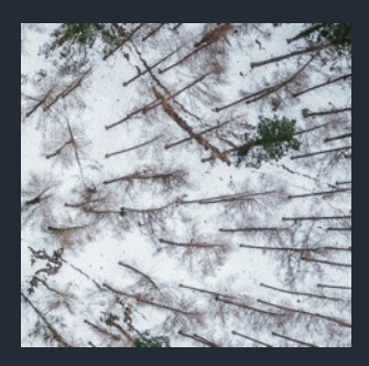
2. Extreme Cold Snaps